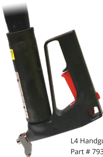
L4 Handgun with down apply adapter kit. Part # 79302-01