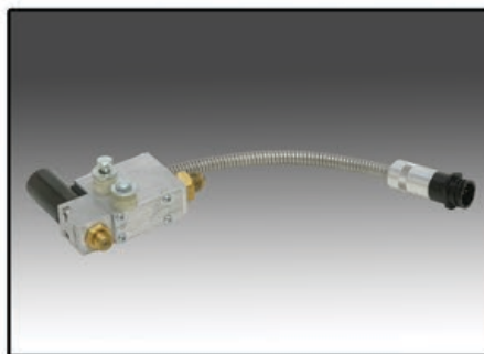
Automatic Electric Gun