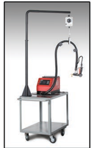
Cart mounted w/ Hose Boom