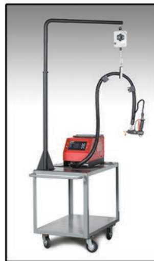
Cart mounted w/ Hose Boom

Hose Boom & Balancer Deck Style Cart Mounted