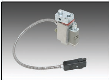
Automatic Pneumatic Gun