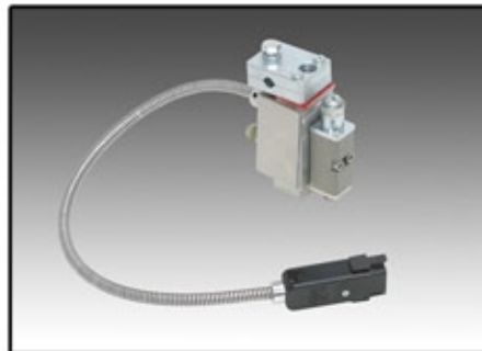
Automatic Pneumatic Gun