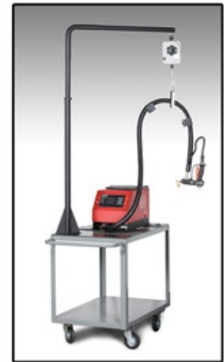
Cart mounted w/ Hose Boom

Hose Boom & Balancer Deck Style Cart Mounted