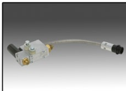
Automatic Electric Gun