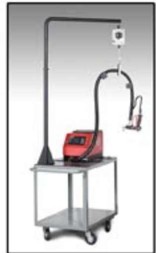
Cart mounted w/ Hose Boom

Hose Boom & Balancer Deck Style Cart Mounted