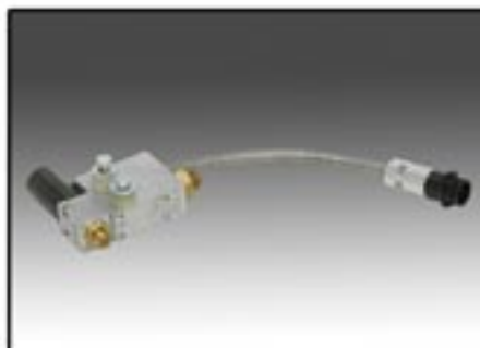
Automatic Electric Gun