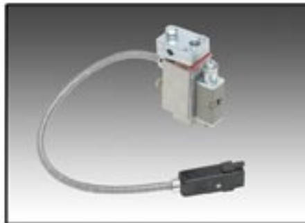
Automatic Pneumatic Gun