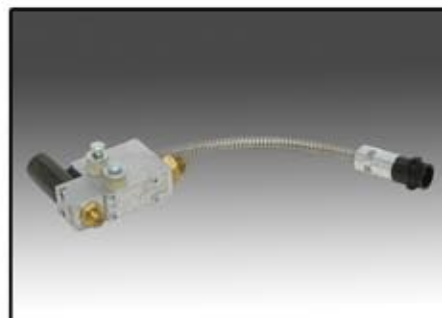
Automatic Electric Gun